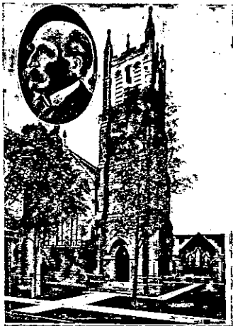
Watertown, N. Y.